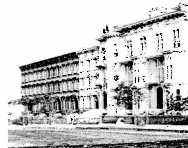
Row houses were built in Chicago as early as the 1860s. Left: Park Row, located east of Michigan Avenue at today's Roosevelt Road (demolished), was a significant early example of the building type.

The Fremont Row House District is a fine example of the high-quality residential row houses constructed in Chicago's neighborhoods as the city rebuilt and expanded following the Fire of 1871. The district represents one of the earliest surviving groups of brick row houses built in Chicago following an 1874 city ordinance that required "fireproof" masonry